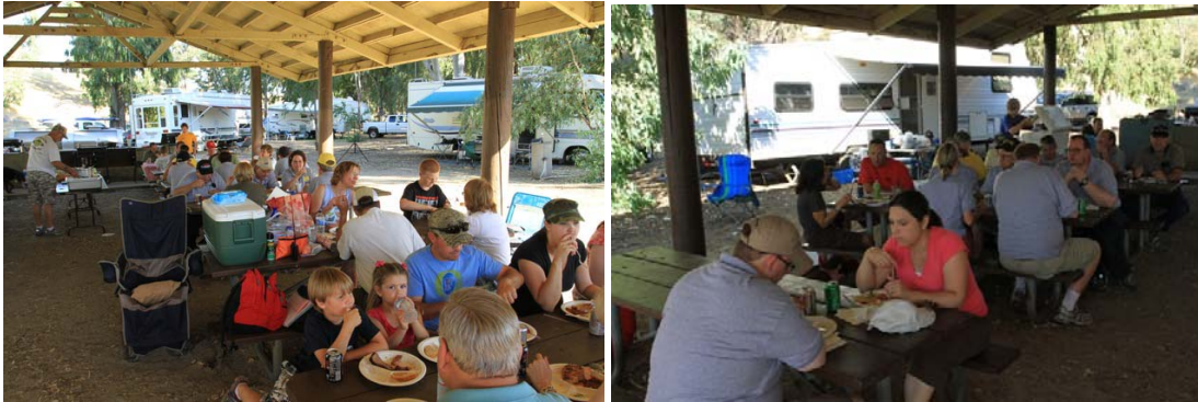
Saturday Night Field Day (Memory of KD6YCB)