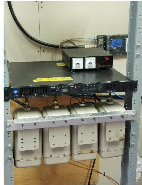
New WIN system Radio