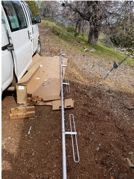
New VHF antenna assembled