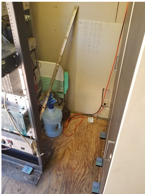
Old equipment that was a nest for the mice