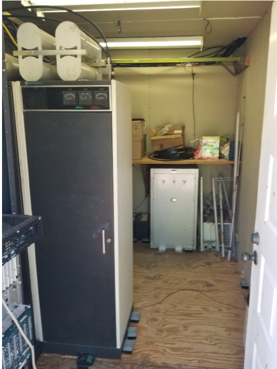
Before the clean up

Mark N6ARP and Lucian KF6NPG went to Mt. Oso for some clean up in the repeater box. Some outdated equipment was removed, and old mouse droppings swept up. The broken 440 antenna mount has been scheduled for repair. Our next project is to organize the work bench.