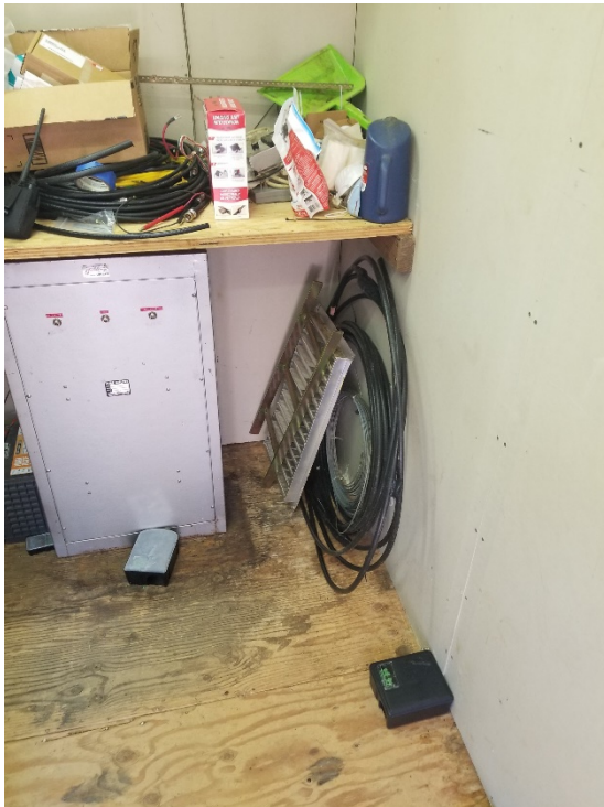
After the cleanup