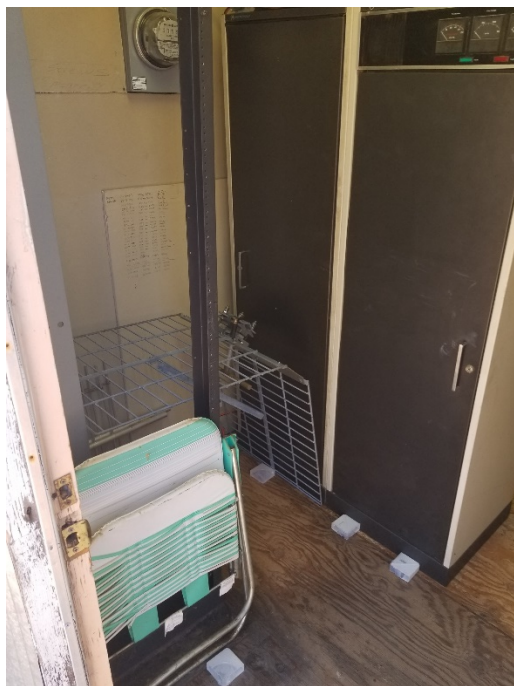
After the clean up