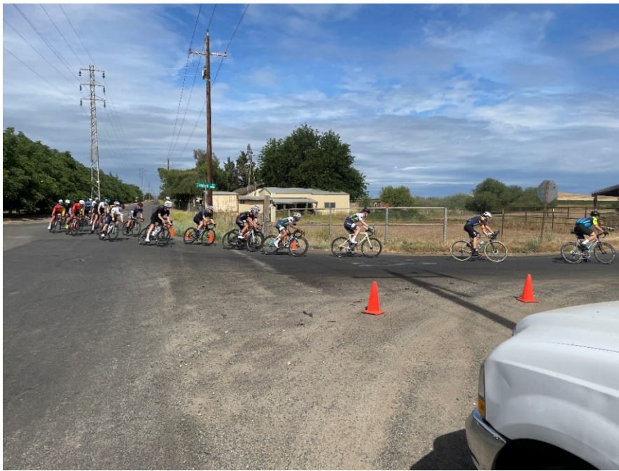
Riders making turn on TimBell