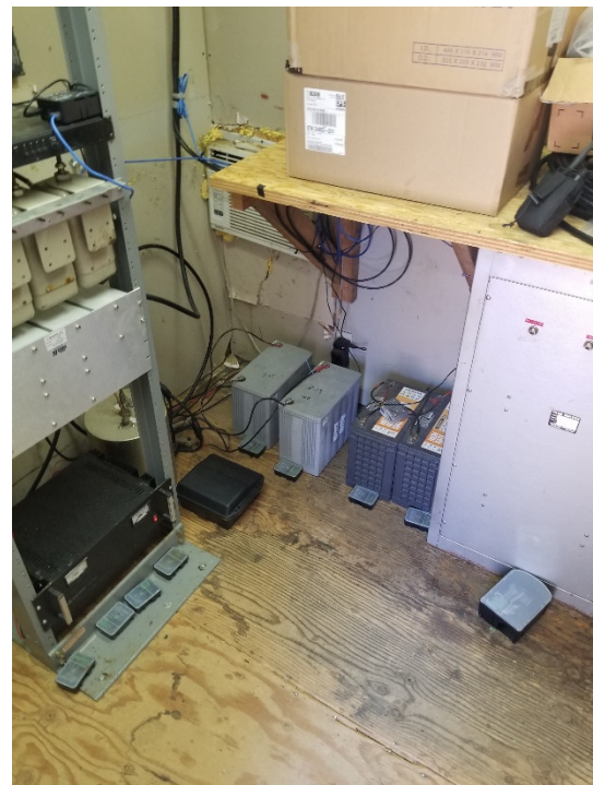
2 batteries that were bad were removed