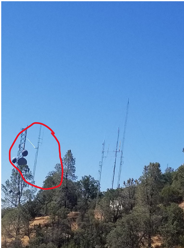
The broken 440 antenna mount