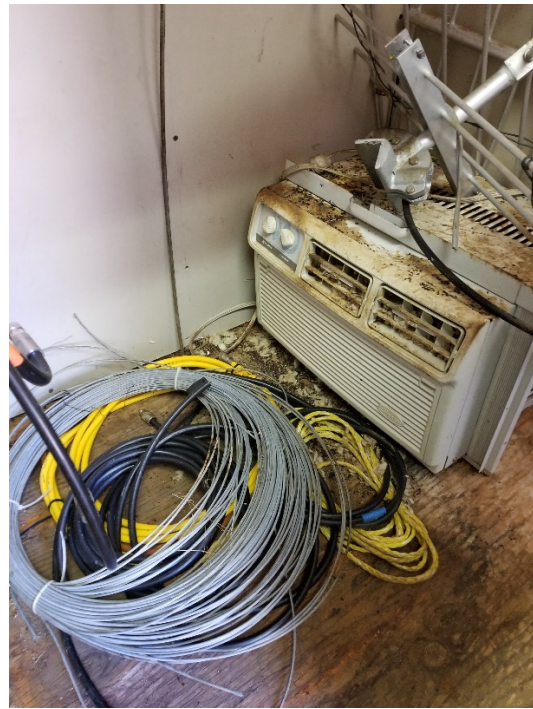
This was next to the silver duplexer box