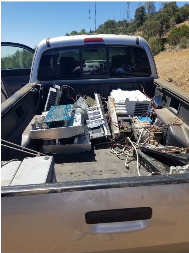
The old equipment that was hauled off