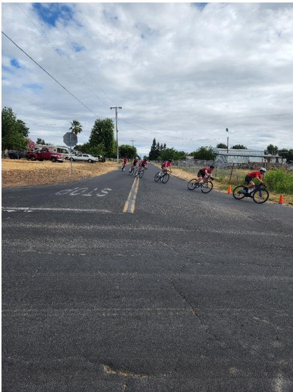
Riders making the turn on Alvarado