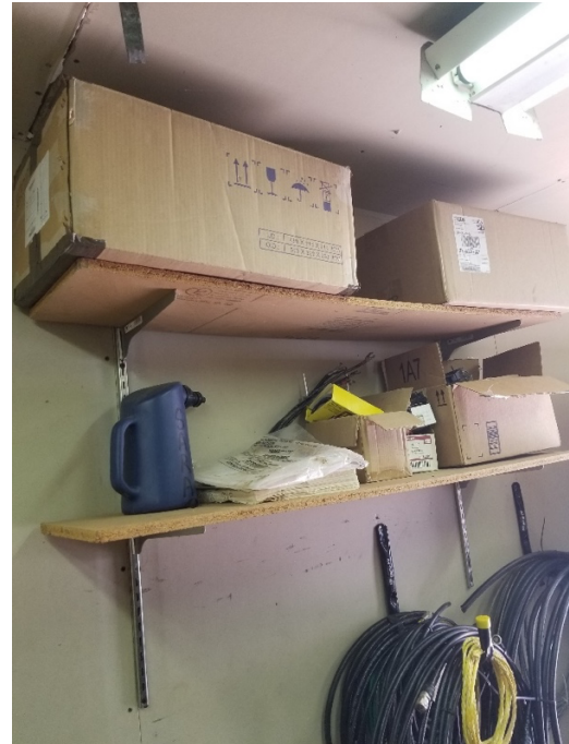
New shelves on side wall