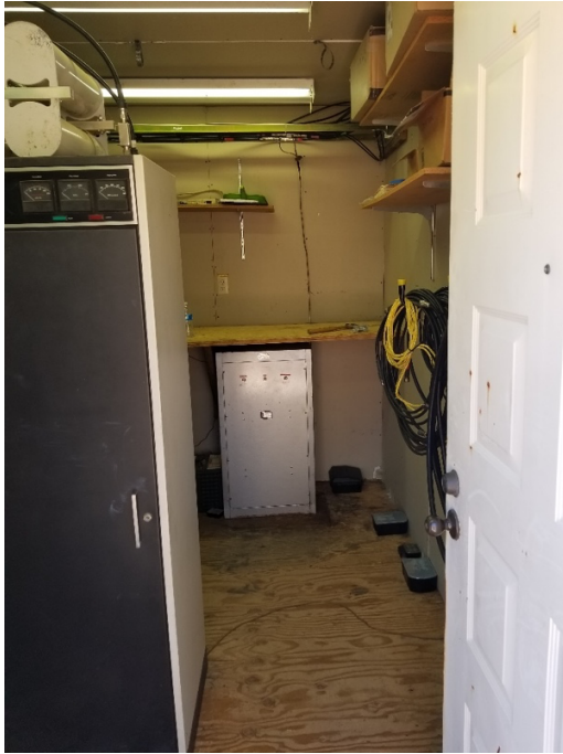
After cleaning up