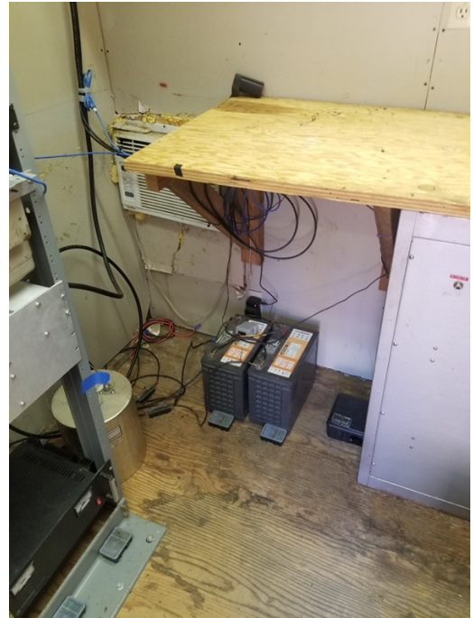
Battery backup for 145.390 repeater