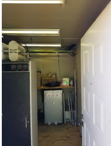
Before cleaning up