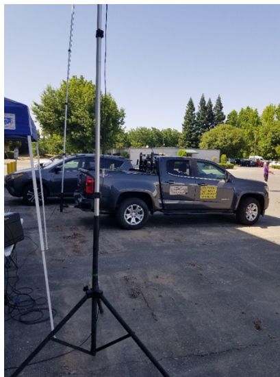
Net Control Station Lucian, KF6NPG

Members of the Stanislaus Amateur Radio Association and Stanislaus ARES helped at the 2023 Regalado Road Race on Saturday June 4, 2023, 0700 to 1200. This race takes place in the Oakdale, CA area. The net control station is located at Burchell Nursery on Wamble Road. The course starts on Wanerville Road. The weather was nice, and the race concluded before it became too warm. There were around 200 riders that participated in the race. The race went well, and we only had 1 rider that required some minor first aid. We had a couple of riders that needed mechanical assistance. The following members helped with the race: Lucian, KF6NPG, Dick, W8AAL, Paul, W6UHF, Ed, KF6FIR, Robert, KD6BNY, Mark, N6ARP, Steve, N5QC, Patrick, KG6AZZ, and Scott, KN6RKY. Thanks to all of the operators who volunteered their time to work this event.