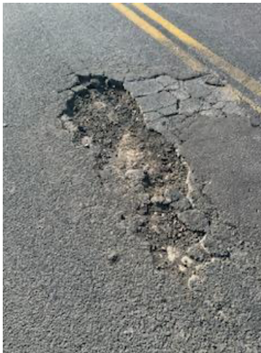
Road Hazard at Feed Zone