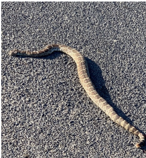
Road Hazard Tim Bell/Warnerville