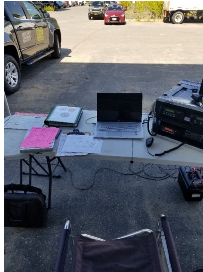
Net Control Station