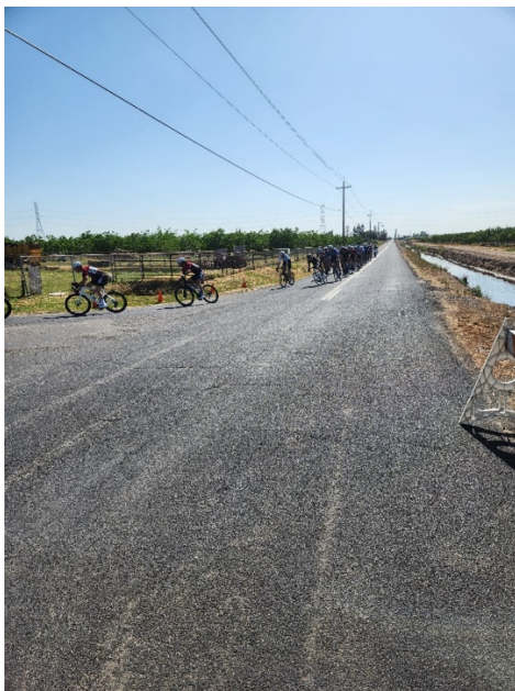
Riders at Alvarado/Stoddard